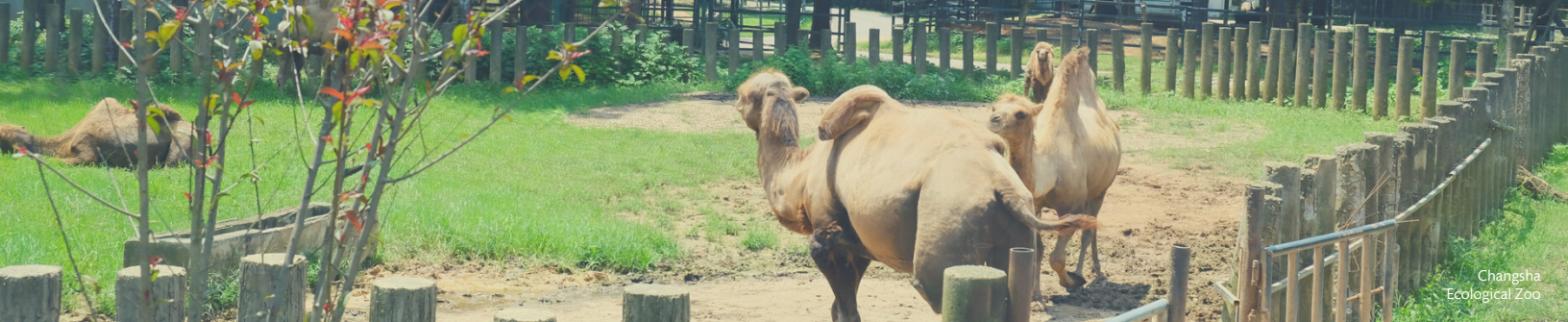
Changsha Ecological Zoo