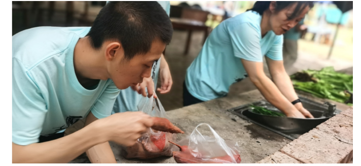
Your generosity is giving them skills! Thank you!