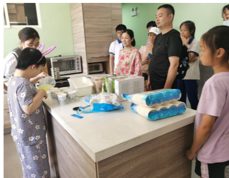
The Lighthouse, Tian Xin District, Changsha