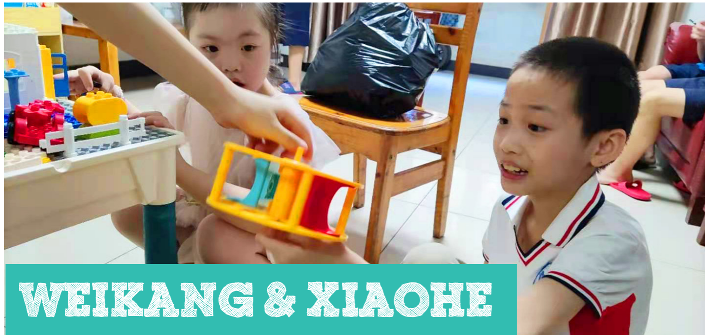
📍 Community Group Home, Changsha Care Centre